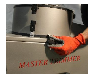
2. Screw the screws to pin up the main cointaner and connect the engine on the top to the electrical circuit.