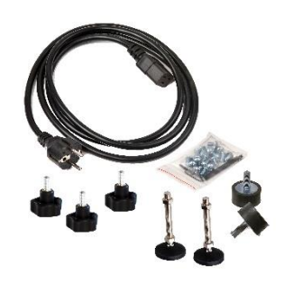
Block MT Gentle